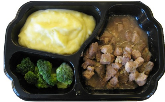
Home meal in its package.