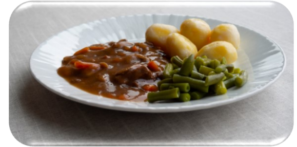
Home meals on plates.